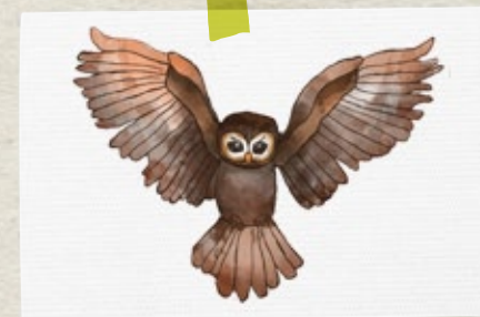
Spotted: Tawny Owl

Notes: A small bird about 20cm long, with black and white speckled feathers. Found in towns, parks and farmland. Starlings flock in huge 'clouds' which move together, wheeling and swooping as a group.