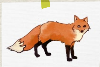
Spotted: Red Fox

Notes: About 20cm long and covered in brown spikes. Lives in gardens and parks. Hedgehogs protect themselves from predators by rolling into a spiky ball.