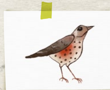
Spotted: Redwing Thrush

Notes: A large mammal with chestnut coloured fur and white flashes on its sides. Mostly found in woodland and parkland, but can stray into towns and cities. Only the male deer (called bucks) have antlers, while females (doe) have none.