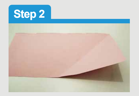
Fold the bottom right corner down to the top edge. Crease down well and unfold.