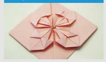
Repeat steps 9 and 10 on the other 3 squares and your heart is very nearly finished! Your paper should now look like this.