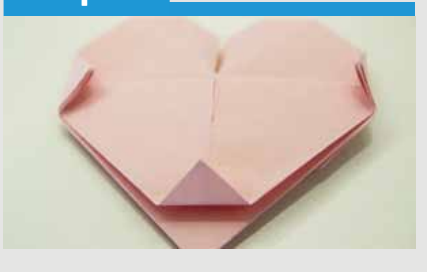
Make 3 small folds on either side of the heart and at the bottom.